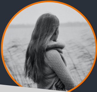
Caren Candidate for Germany