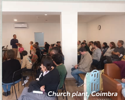
Church plant, Coimbra

"We are Comunidade da Graça Coimbra, a young church plant launched in 2023 in Coimbra, Portugal. Known as the "city of knowledge" and boasting one of Europe's oldest universities, Coimbra is home to a vibrant, multicultural community that we want to reach with the gospel of Jesus. Last year, we rented a centrally located space near the university and football field, where we are engaging a community that needs salvation. Since then, the church is growing in unexpected ways!"